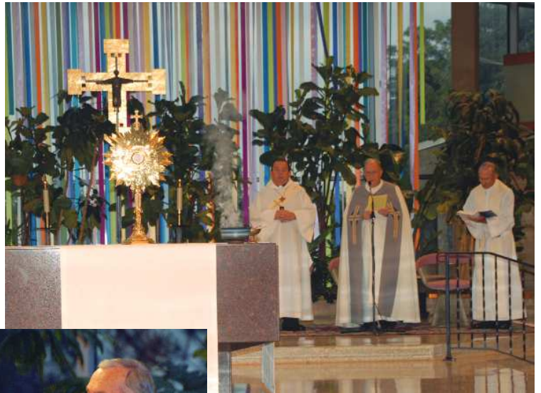
▲ Opening Prayer Service with Eucharistic Adoration and Benediction