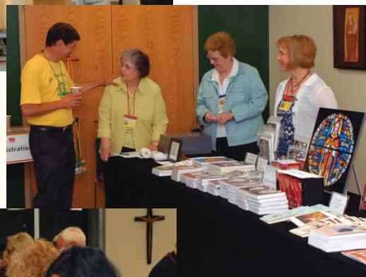
◀◀ Nourishing body and spirit