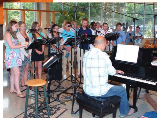
▼ Teen LITE choir, leading the singing for the Sunday Eucharist