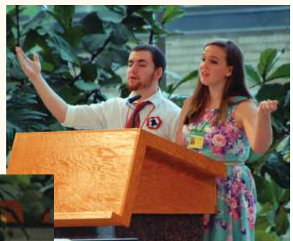
▶ Leaders of song from the Teen LITE group