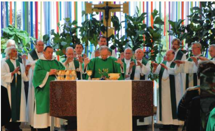
◀ Concelebration of the Eucharist on Sunday morning