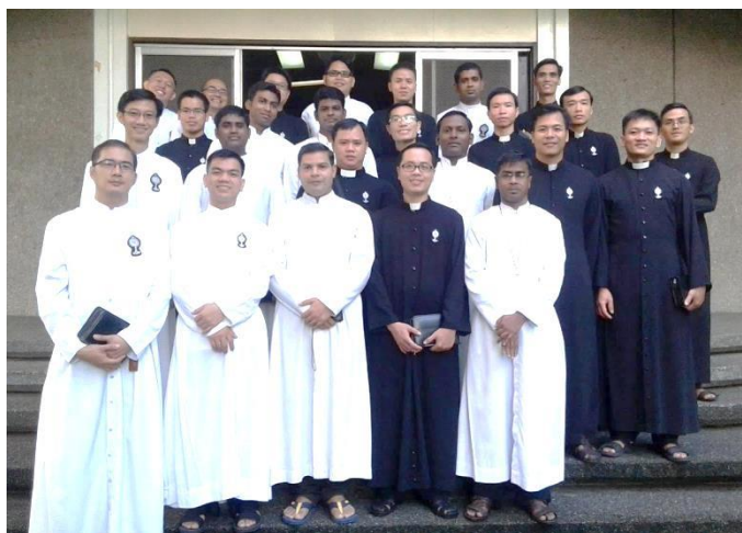
The 25 SSS scholastics from the Asia-Oceania Conference who are participating in the International Preparation for Perpetual Profession Program (IP4) being held in the Philippines.

The Asia-Oceania Conference agreed to hold an International Preparation for Perpetual Profession Program (IP4) this 2016 during its meeting which took place in Ho Chi Minh City, Vietnam, from January 19-21, 2016.