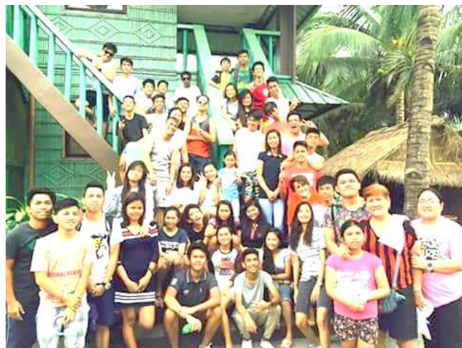
Some of the parish youth and youth ministers of Sta. Cruz Parish during their Summer Camp in Zambales.

The past summer time gave the opportunity for the parishes and shrines being administered by the SSS to stage different programs of animation for the youth. This shows the commitment of the Congregation in preparing the youth to take up a more active role in the future of the country and in arousing in them the interest to serve God and the Church.