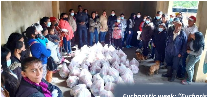
Eucharistic week: "Eucharist, bond of charity and fraternity"

One would not imagine such a chaotic and inhuman reality in a big city like Bogotá but in more distant environments such as the regions of Chocó, La Guajira, among others, as reported by the media.