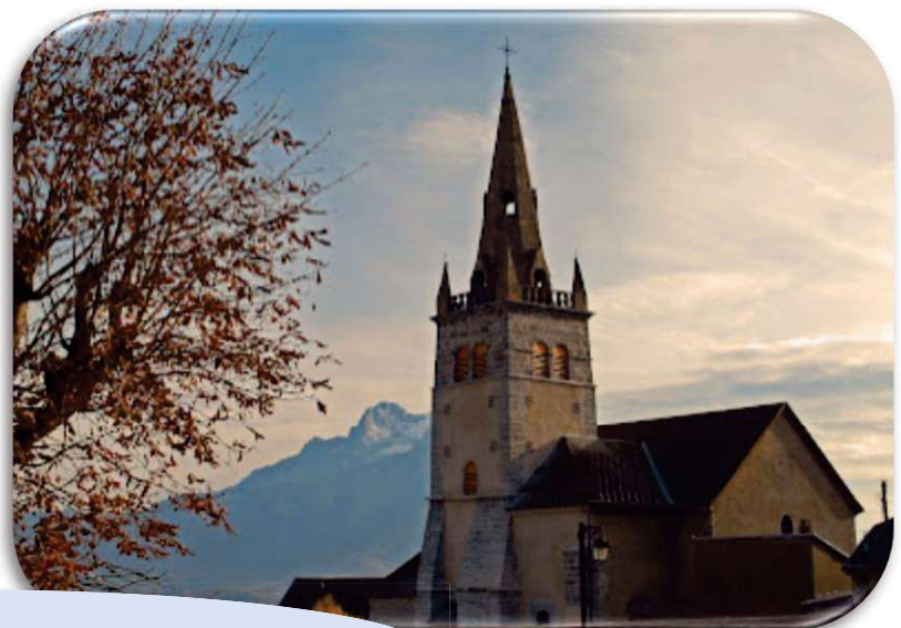
La Mure, St Peter Julian Eymard church